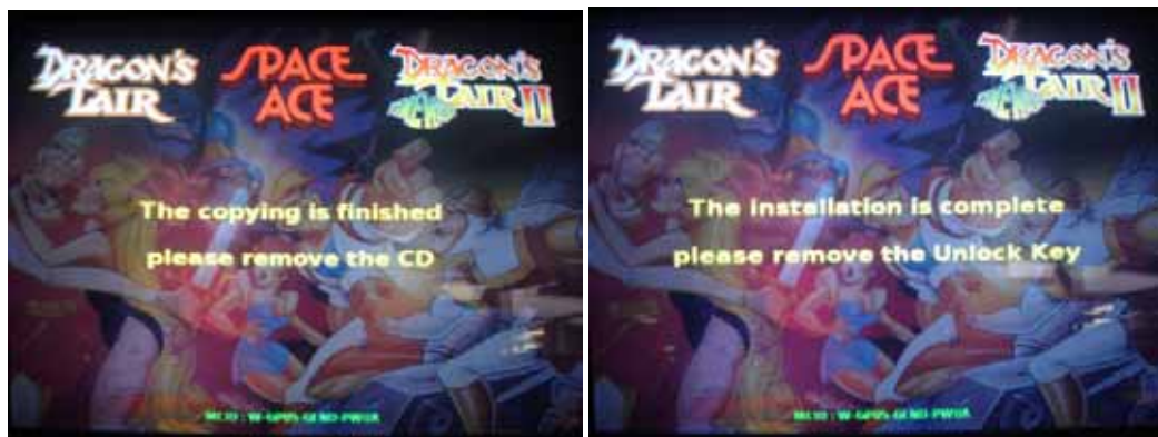
Figure 3. Remove CD and Installation Complete Screens