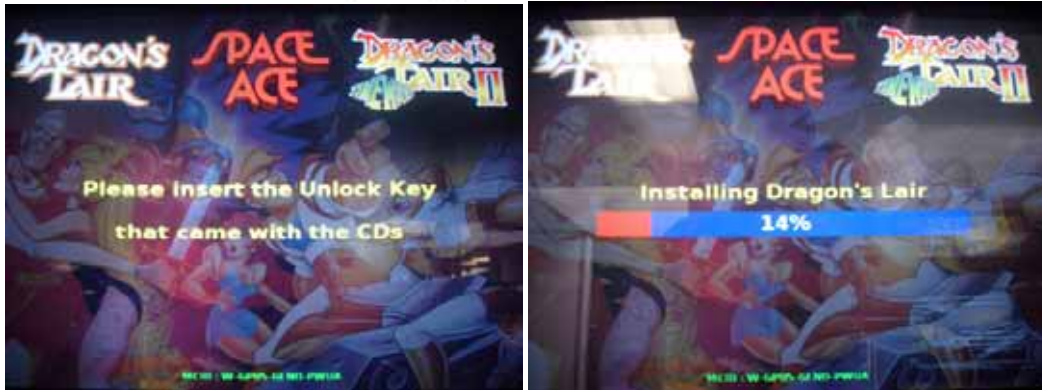
Figure 2. Insert Unlock Key and Installation Screens