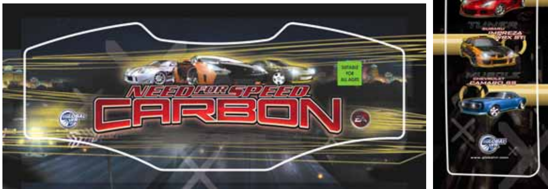
Figure 1. Trimming the Artwork (27" Flat CRT Monitor Cabinet)