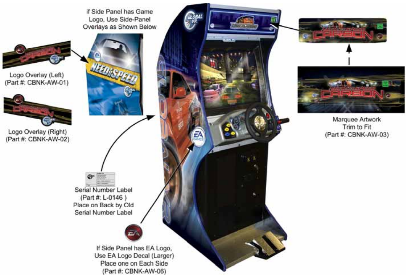
Figure 12. Graphics Placement (Upright Cabinet)