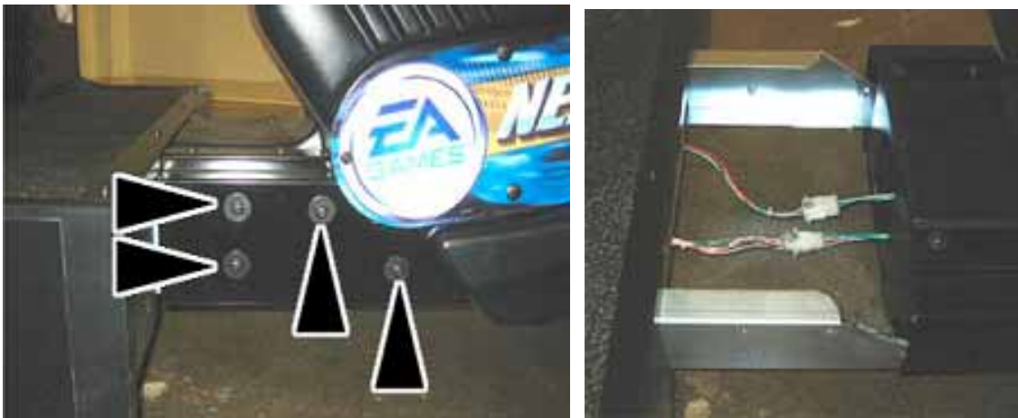
Figure 6. Separating Seat Assembly (39" Deluxe)