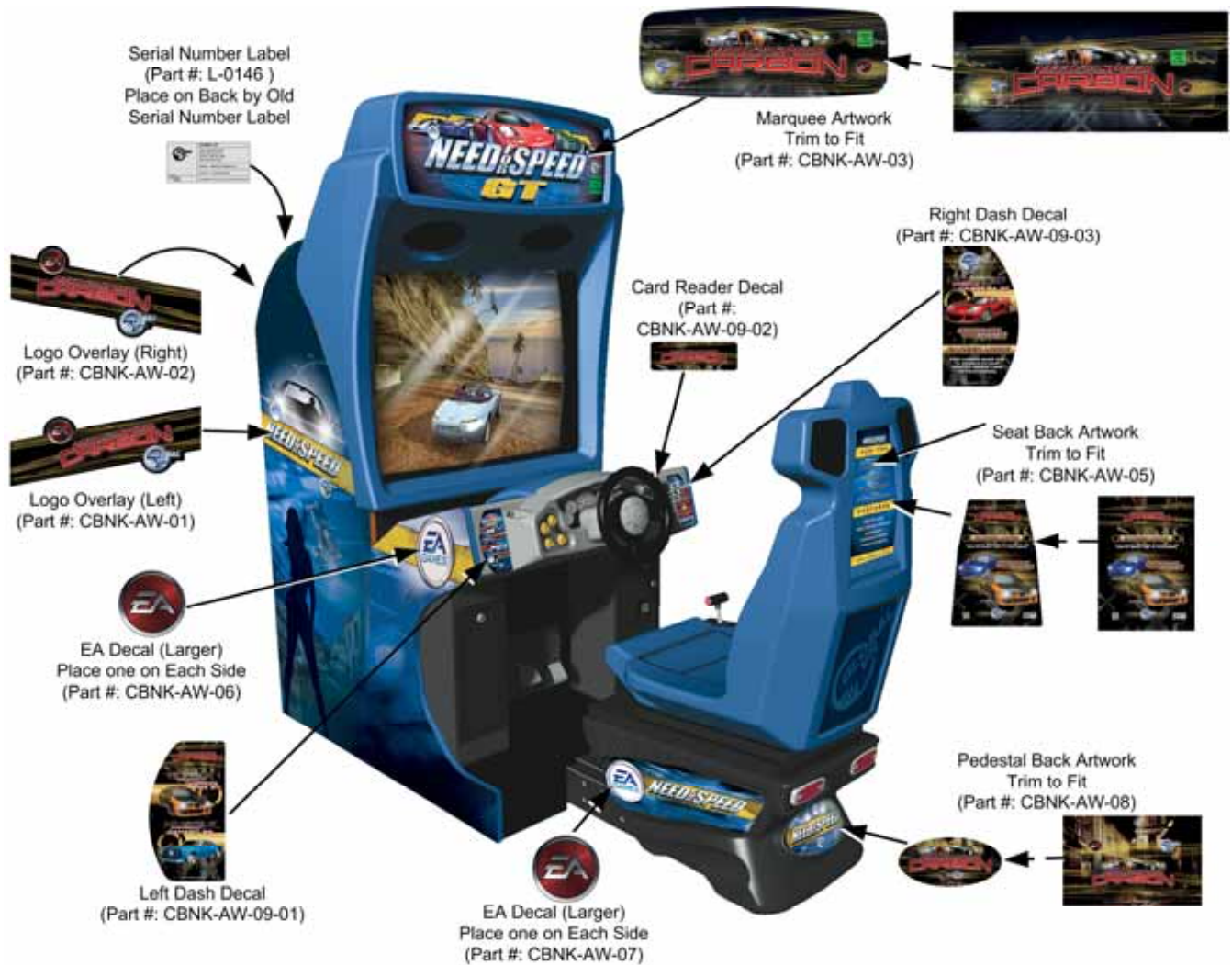
Figure 9. Graphics Placement (39" Deluxe)