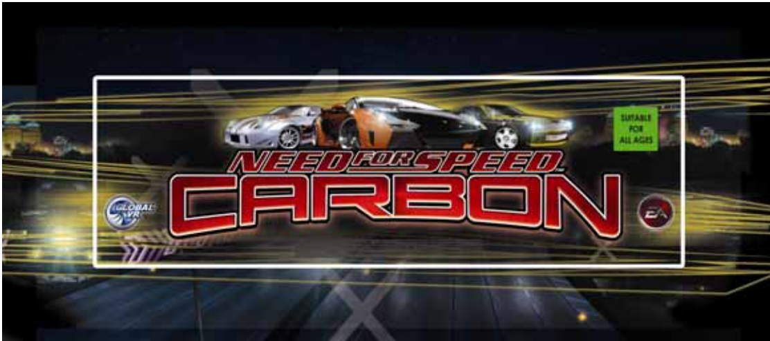
Figure 11. Trimming Marquee Artwork (Upright Cabinet)