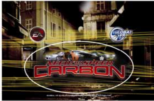
Figure 8. Trimming Pedestal Artwork (Seat Type 1)