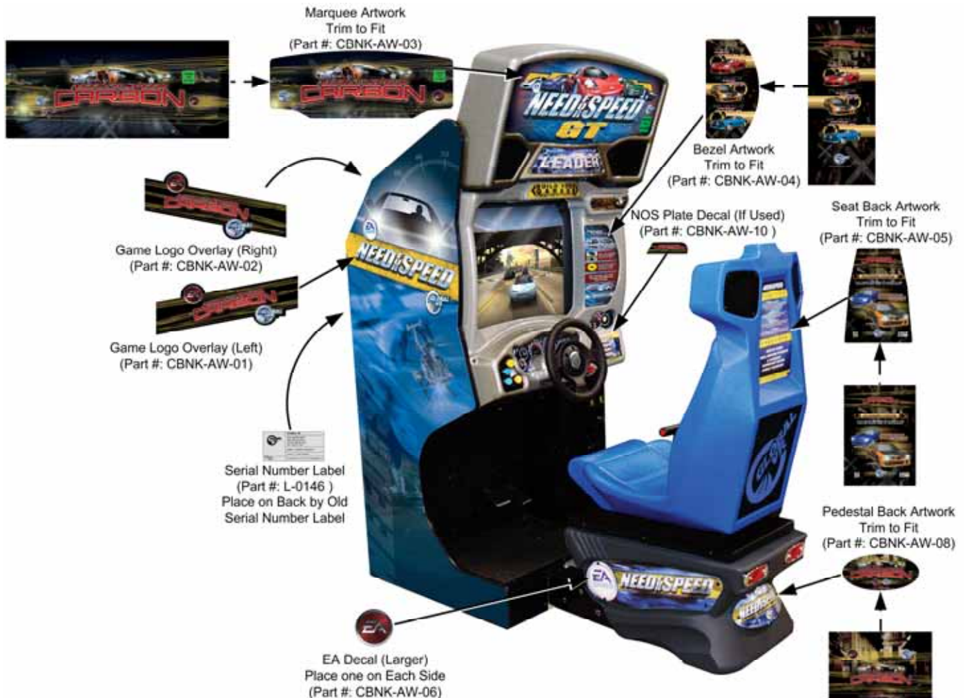
Figure 4. Graphics Placement (27" Curved CRT Monitor Cabinet)