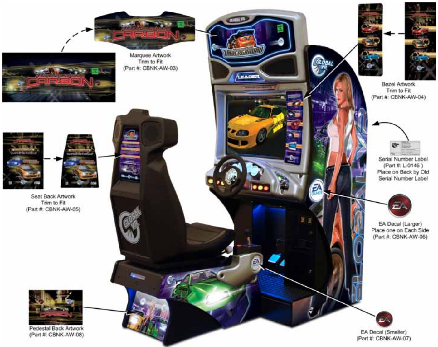
Figure 2. Graphics Placement (27" Flat CRT Monitor Cabinet)