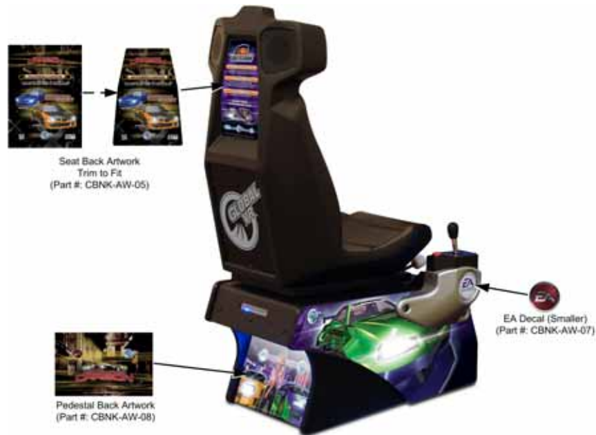
Figure 10. Seat Type 2 (39" Deluxe)