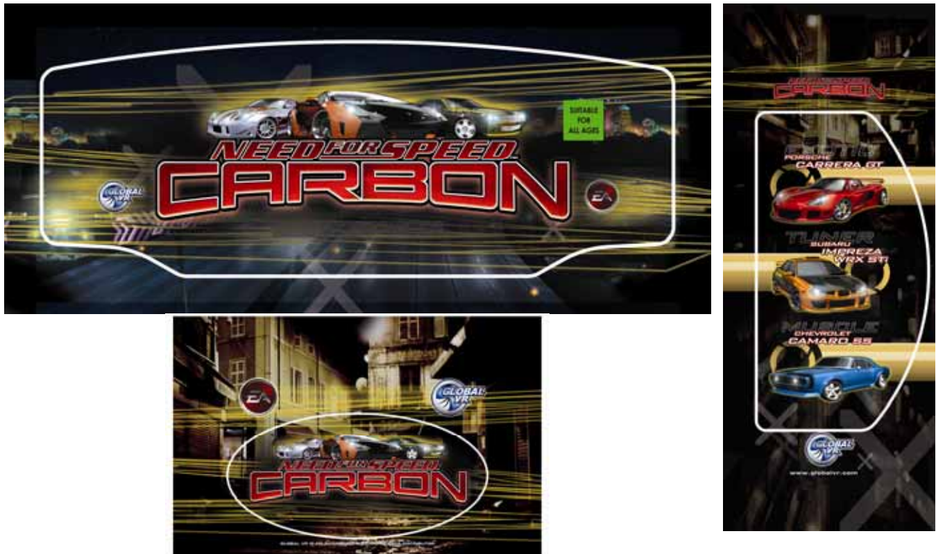
Figure 3. Trimming the Artwork (27" Curved CRT Monitor Cabinet)