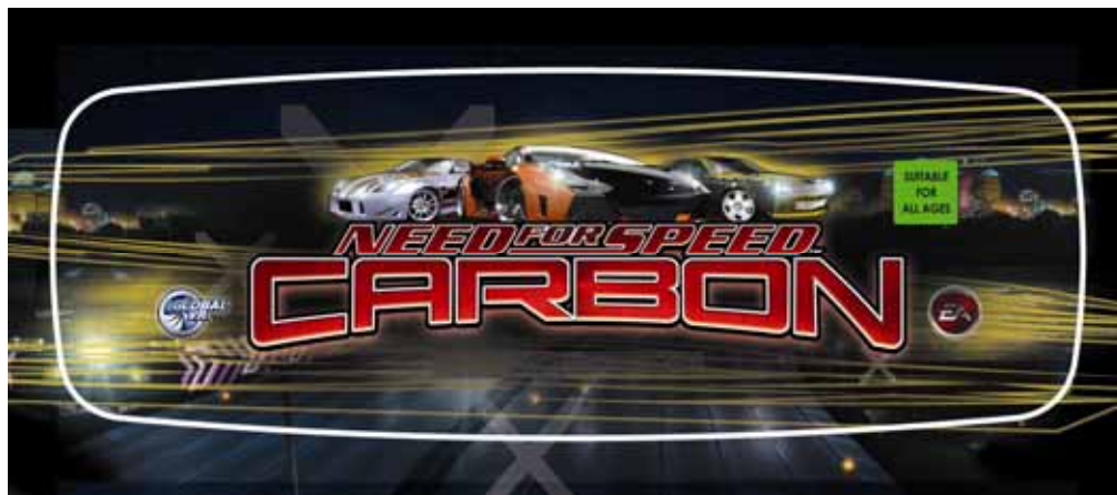
Figure 7. Trimming Marquee Artwork (39" Deluxe)