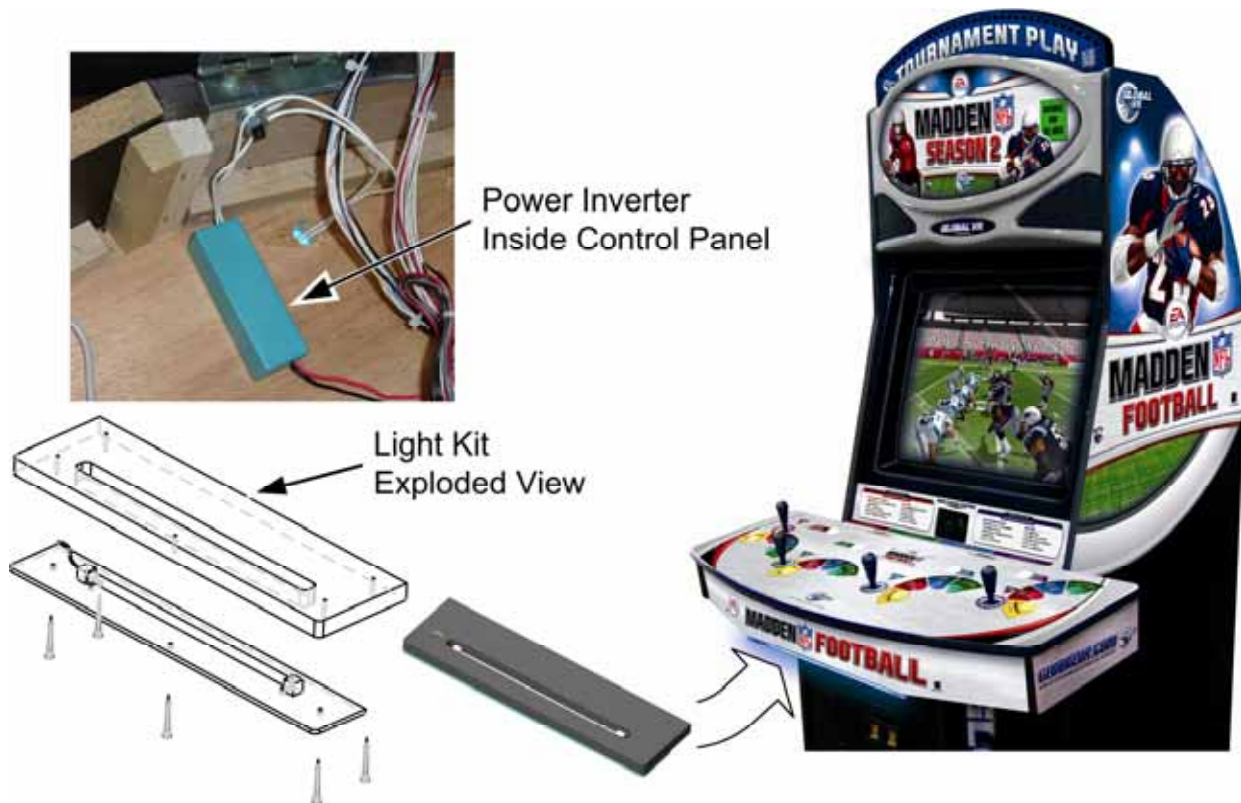
Figure 3. Lighting Kit Installation