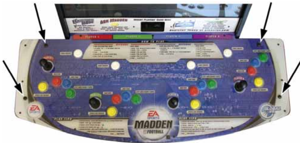
Figure 1. Remove Bolts Shown Above