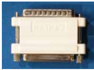
Parallel Game Dongle