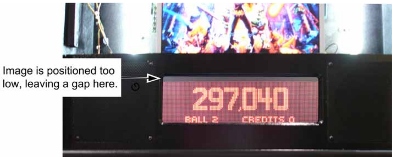
Dot Matrix Display out of Adjustment

Solution: Follow the steps in this document to reposition the DMD image on your backglass monitor.